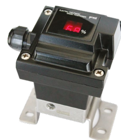
A234 Series PRD

A234 Series smart positioners owing to their compact design and advanced features are well suited for modulating control applications.