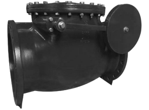
Opsiyonel Ağırlık Kollu Çalpara Çekvalf